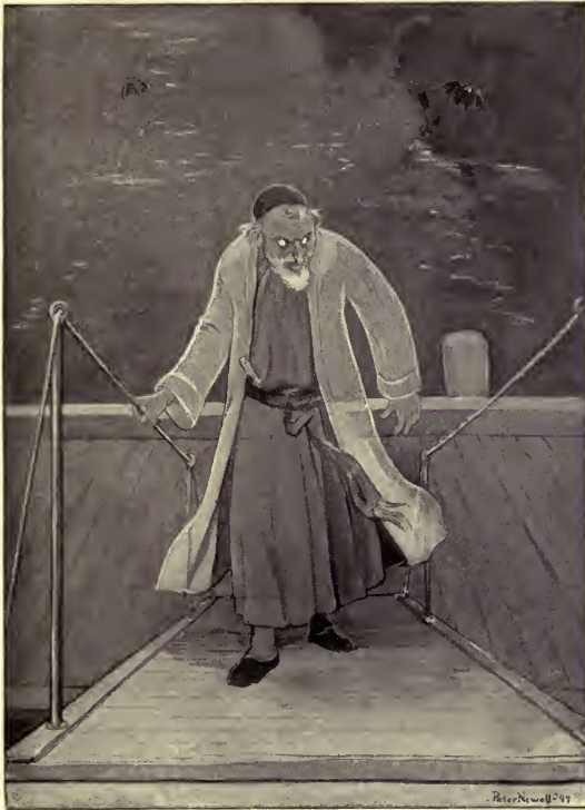
“ IN THE DEAD OF NIGHT SHYLOCK HAD STOLEN UP THE GANG-PLANK ”